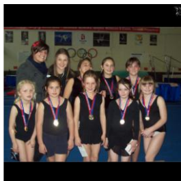
Gymfun 3 & 4 White Team - 1st place