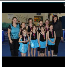
Gymfun 1 & 2 Aqua Team - 2nd place

Boys: Black shorts & plain white t-shirt