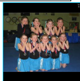
Gymfun 3 & 4 Aqua Team - 3rd place